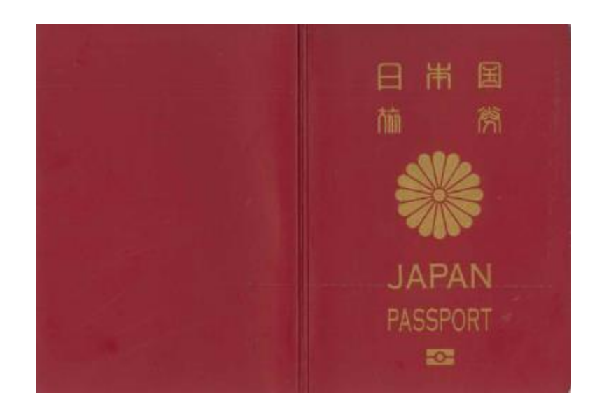
Passport cover page